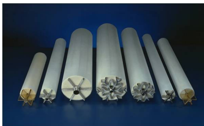
KMS Spiral Wound Elements