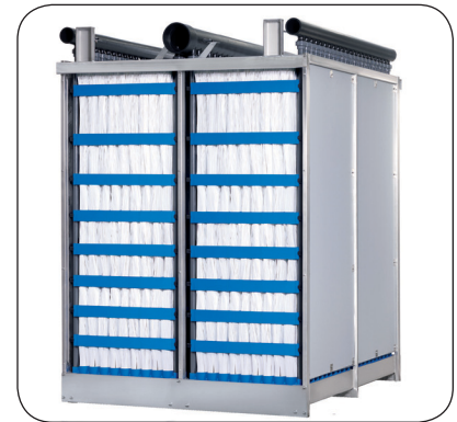
PURON® MBR Module

KMS' PURON® MBR modules are well suited for municipal wastewater treatment and reuse. PURON modules are designed to provide significantly lower lifecycle costs, including a single header design that provides better solids management in the module, braided fibers to reduce the risk of fiber breakage, and highly effective air scouring that virtually eliminates sludging.