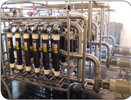
Woodbridge 3-stage Continuous WINEFILTER™ System

before the cartridges needed to be replaced; the newer system filtered nearly 27 million gallons before cartridge replacement.