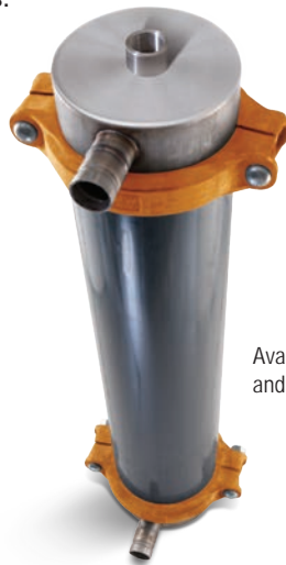
Available in 8" and 10" diameters