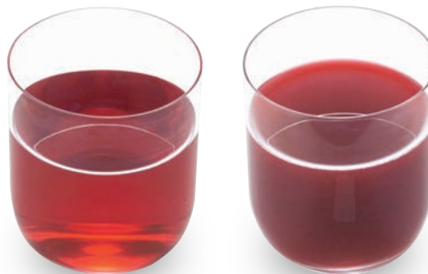
Feed 10 Brix